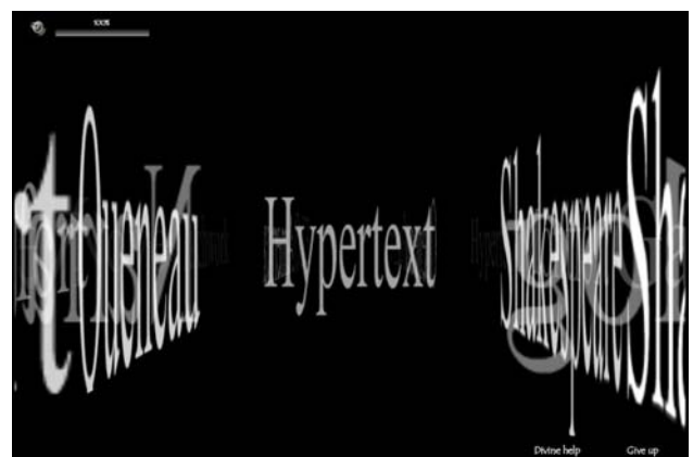
Figure 2. The Erymanthean Boar.